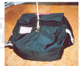
(Step 9 a.)

Insert the canopy into pack, tie pilot chute to the top of the canopy, and compress the pilot chute pack