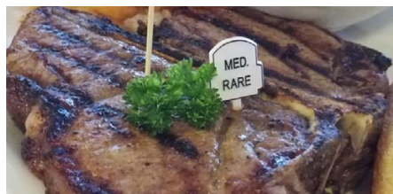
T-Bone Tom's 707 Texas 146, Kemah, TX (281) 334-2133