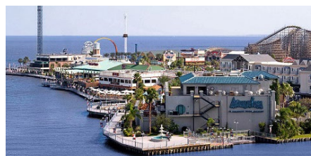
Kemah Boardwalk 215 Kipp Ave., Kemah, TX (877) 285-3624