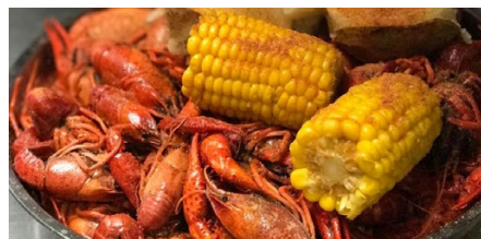
Baytown Seafood 9205 S. Main St., Houston, TX (713) 666-7070