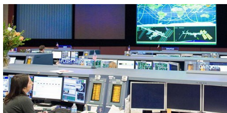
Johnson Space Center 2101 NASA Pkwy., Houston, TX (281) 483-0123