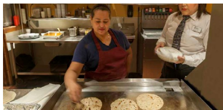
Ninfa's Mexican Restaurant 14737 Memorial Dr., Houston, TX (281) 497-5100