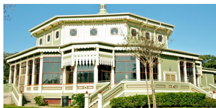
Galveston Town of Galveston (409) 797-3500