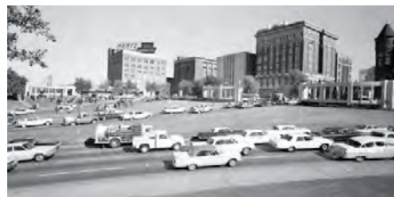
Dealey Plaza 411 Elm St., Dallas, TX (214) 747-6660