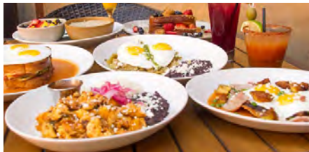
El Fenix / Meso Maya Dallas 1845 Woodall Rodgers Fwy., Dallas, TX (972) 241-2171