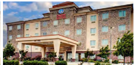
Comfort Suites Waxahachie 131 RVG Plaza, Waxahachie, TX (469) 517-1600