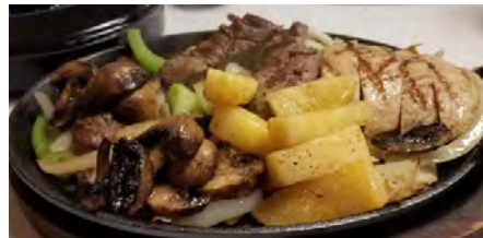
Mi Casa Waxahachie 1200 Ferris Ave., Waxahachie, TX (214) 463-5904