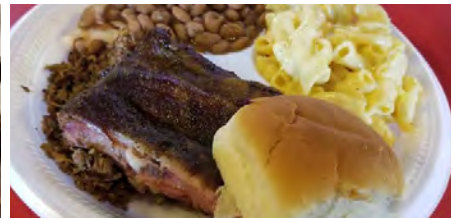
Pit Stop BBQ Waxahachie 3921 U.S. 287, Waxahachie, TX (972) 923-8921