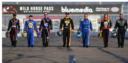
Don Schumacher Racing 1681 E. Northfield Dr., Brownsburg, IN (317) 858-0356