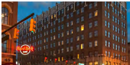
Hampton Inn Downtown 105 S. Meridian St., Indianapolis, IN (317) 261-1200