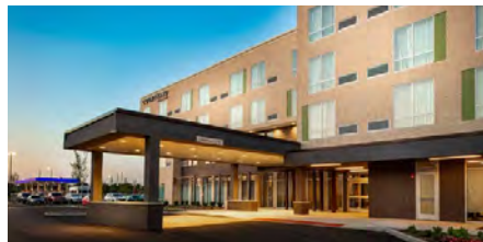
Courtyard By Marriott West Speedway 6315 Crawfordsville Rd., Speedway, IN (317) 396-6600