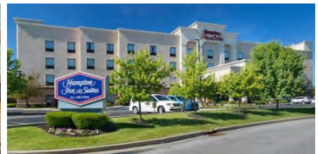
Hampton Inn Brownsburg 41 Maplehurst Dr., Brownsburg, IN (317) 852-5800