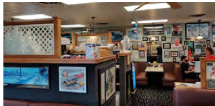
Charlie Brown's 1038 N. Main St., Indianapolis, IN (317) 243-2502