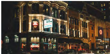
St. Elmo's 127 S. Illinois St., Indianapolis, IN (317) 635-0636