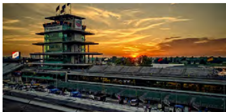
Indianapolis Motor Speedway 4790 W. 16th St., Indianapolis, IN (317) 492-8500