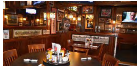
Union Jack 6225 W. 25th St., Speedway, IN (317) 243-3300