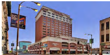
Hampton Inn Gateway Arch 333 Washington Ave., St. Louis, MO (314) 621-7900