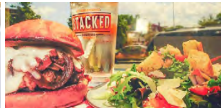
Stacked STL 7637 Ivory Ave., St. Louis, MO (314) 544-4900