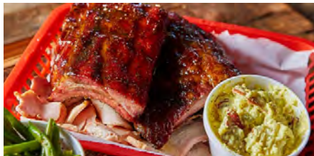
Pappy's Smokehouse 3106 Olive St., St. Louis, MO (314) 535-4340