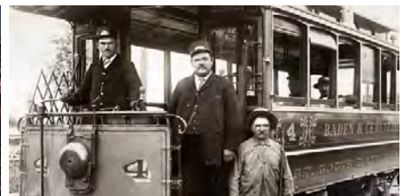
National Museum of Transportation 2933 Barrett Station Rd., St. Louis, MO (314) 965-6212