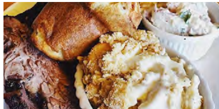
Salt + Smoke 6525 Delmar Blvd., St. Louis, MO (314) 727-0200