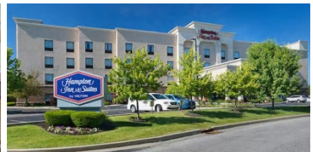
Hampton Inn Brownsburg 41 Maplehurst Dr., Brownsburg, IN (317) 852-5800