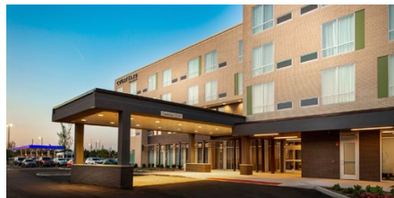
Courtyard By Marriott West Speedway 6315 Crawfordsville Rd., Speedway, IN (317) 396-6600