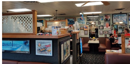
Charlie Brown's 1038 N. Main St., Indianapolis, IN (317) 243-2502