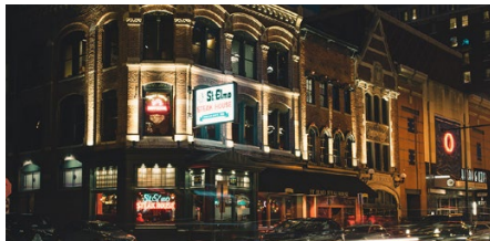
St. Elmo's 127 S. Illinois St., Indianapolis, IN (317) 635-0636