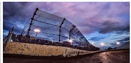
Kokomo Speedway (Sunday Night) 2455 N. Davis Rd., Kokomo, IN (765) 459-3877