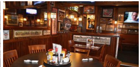
Union Jack 6225 W. 25th St., Speedway, IN (317) 243-3300