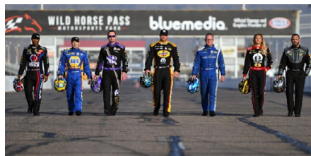
Don Schumacher Racing 1681 E. Northfield Dr., Brownsburg, IN (317) 858-0356